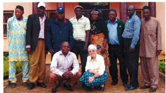
The Water Management Advisory Committee, Kumbo